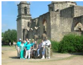
OWLS visiting San Antonio Missions

Our Day Out for April was a visit to three of San Antonio missions. First was a guided tour of the largest,