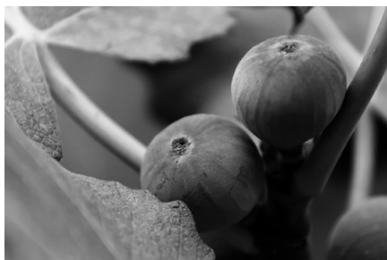
Fig – I have great success with the Celeste variety. A small but flavorful fruit. Needs little maintenance. Figs don't keep well so Fig jam is a great way to use them. I planted a stick in the ground and have a huge tree half the size of my house.

Lemon – nothing beats a delicious Meyer Lemon (which is actually a cross between a lemon and an orange). A special bonus is deliciously fragrant blossoms! When you have a bumper crop squeeze and freeze the juice for use throughout the year. Mine is planted in a pot so it can be easily moved to shelter in freezing temperatures.