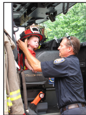
A firefighter assists a young boy at the 2017 McGruff Puppet Show/Fire Truck Display.

This popular event always packs the house! Your children will meet some real American heroes – police officers, firefighters and