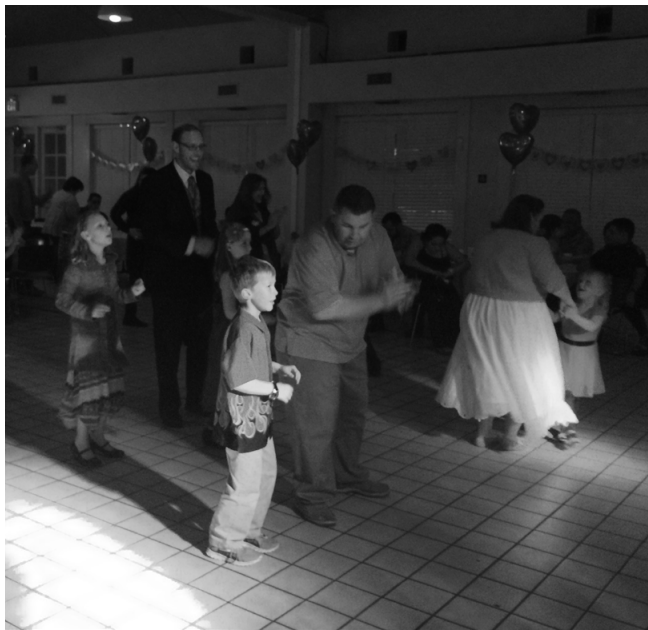
Parents dance with their children at the Valentine's Parents & Child Dinner and Dance.

Thank you to Chapparitas Mexican Restaurant for their kind donation of the food. Other contributors to the event were: Woodforest Bank, Great Clips, Deck The Walls, Wash Tub and Raising Canes. Looking forward to making the 3 rd one even better!!