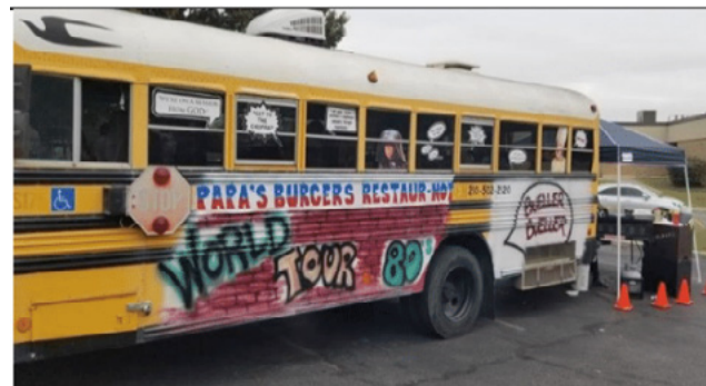
The Papa's Burger Bus pulled into the Great Northwest Silver Creek Lodge to serve up some tasty burgers for our First Responders and guests.