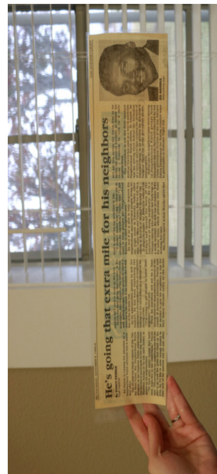
Original article from the San Antonio Light