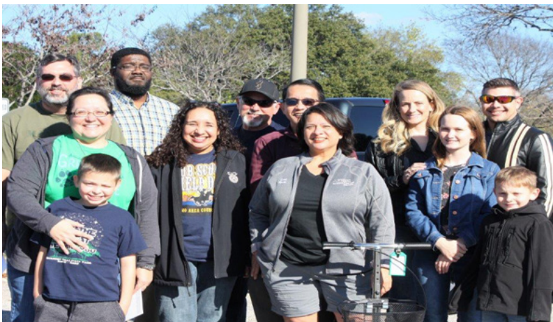
Volunteer Judges from the Holiday Lights Contest