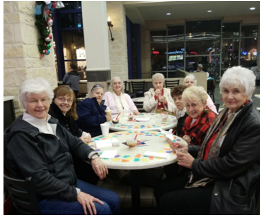
Owls having fun at the River Walk.