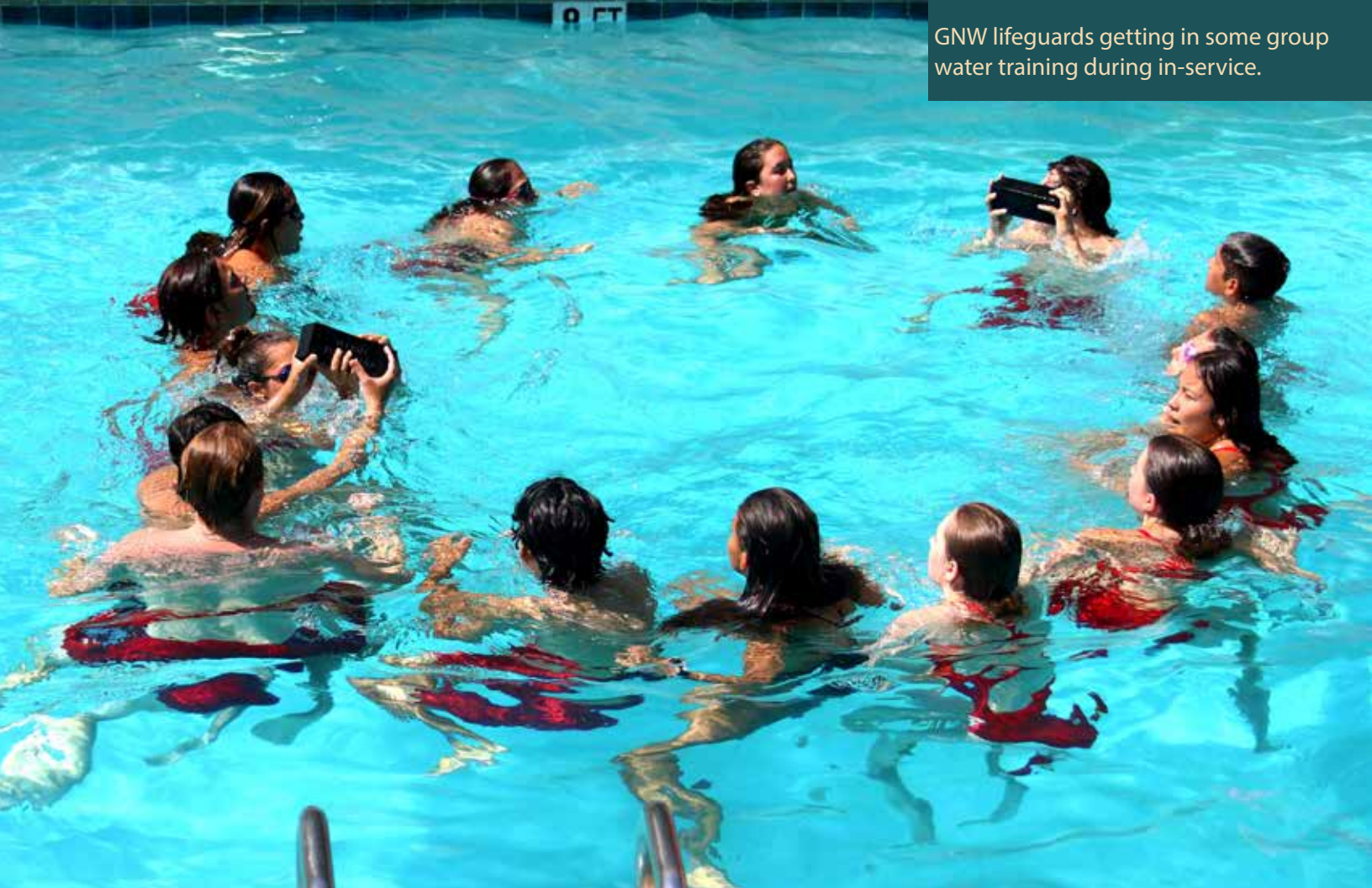
GNW lifeguards getting in some group water training during in-service.