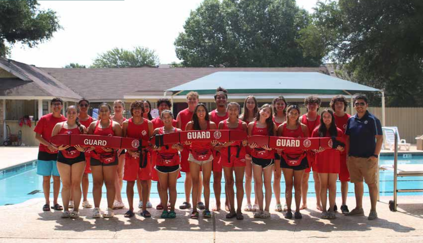
GNW's 2023 lifeguard staff at their first in-service of the season.