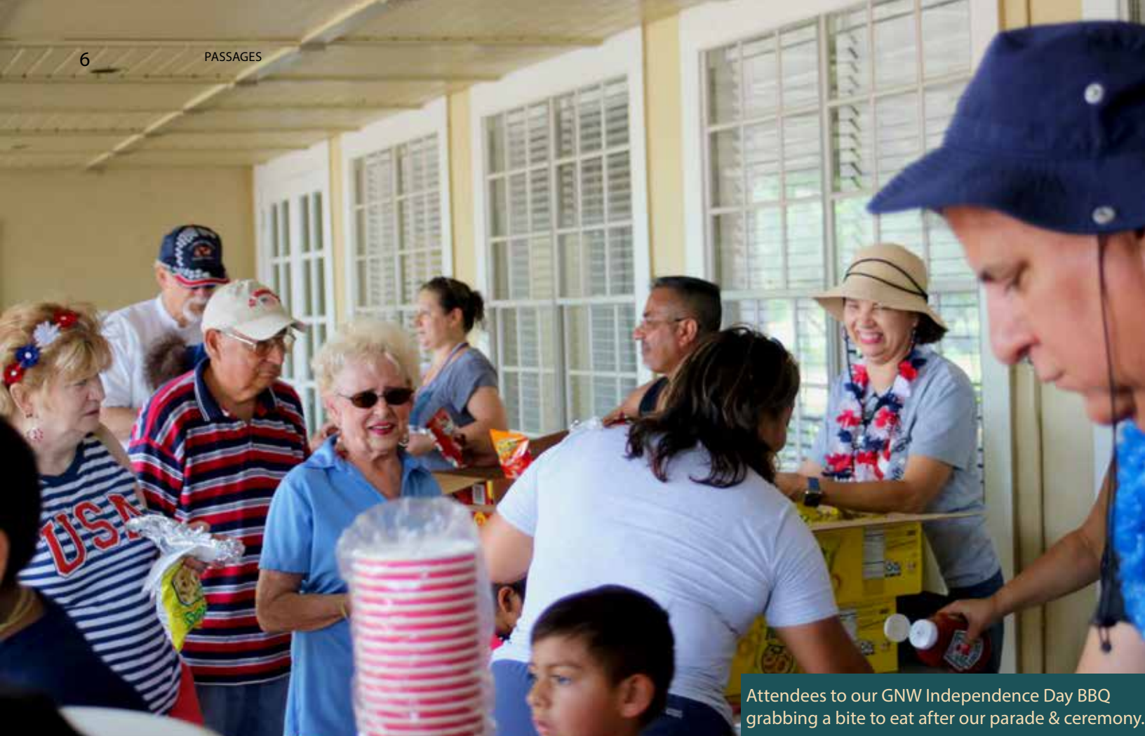
Attendees to our GNW Independence Day BBQ grabbing a bite to eat after our parade & ceremony.