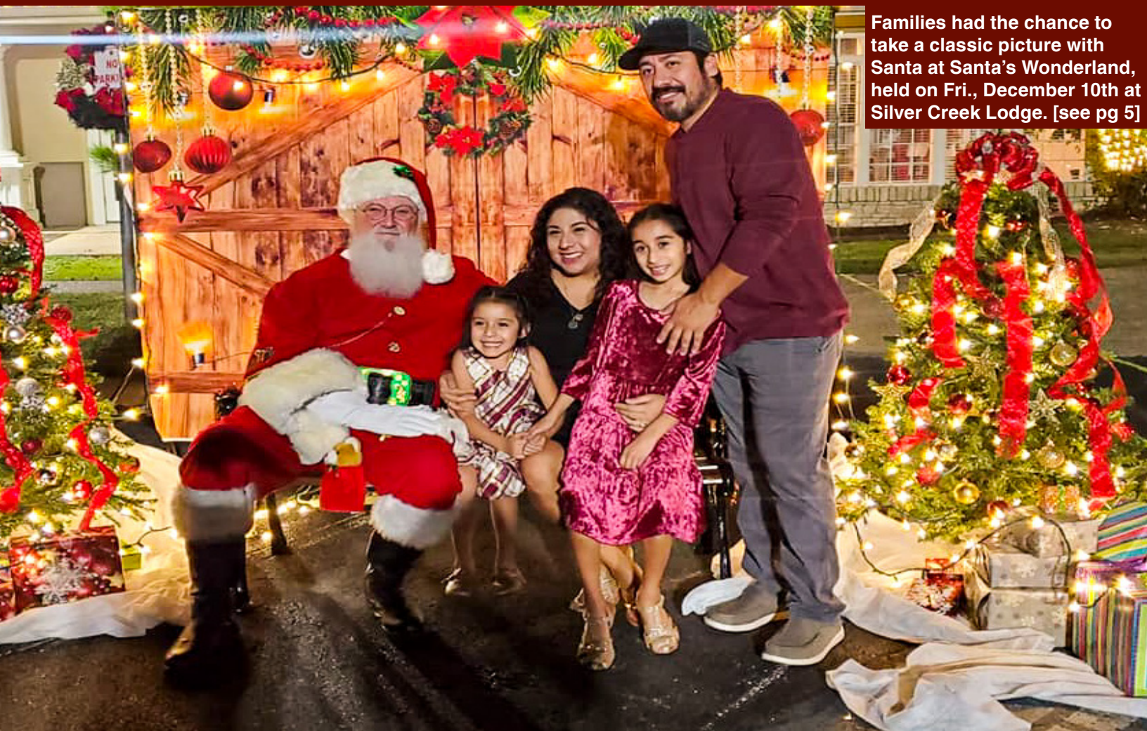
Families had the chance to take a classic picture with Santa at Santa's Wonderland, held on Fri., December 10th at Silver Creek Lodge. [see pg 5]