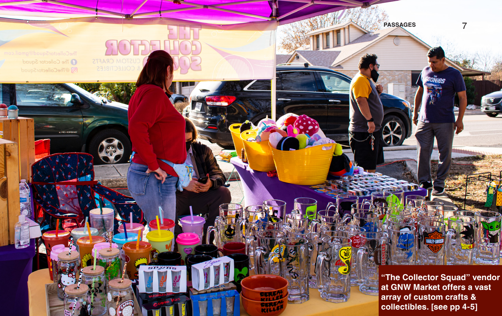
"The Collector Squad" vendor at GNW Market offers a vast array of custom crafts & collectibles. [see pp 4-5]