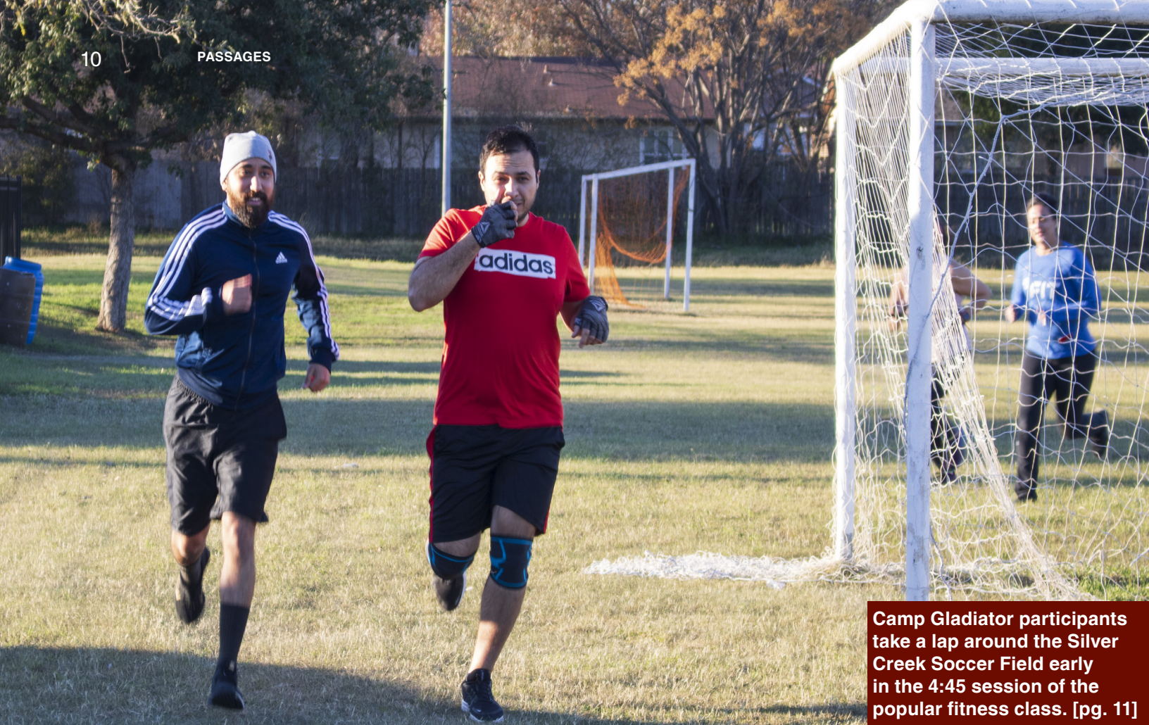
Camp Gladiator participants take a lap around the Silver Creek Soccer Field early in the 4:45 session of the popular fitness class. [pg. 11]