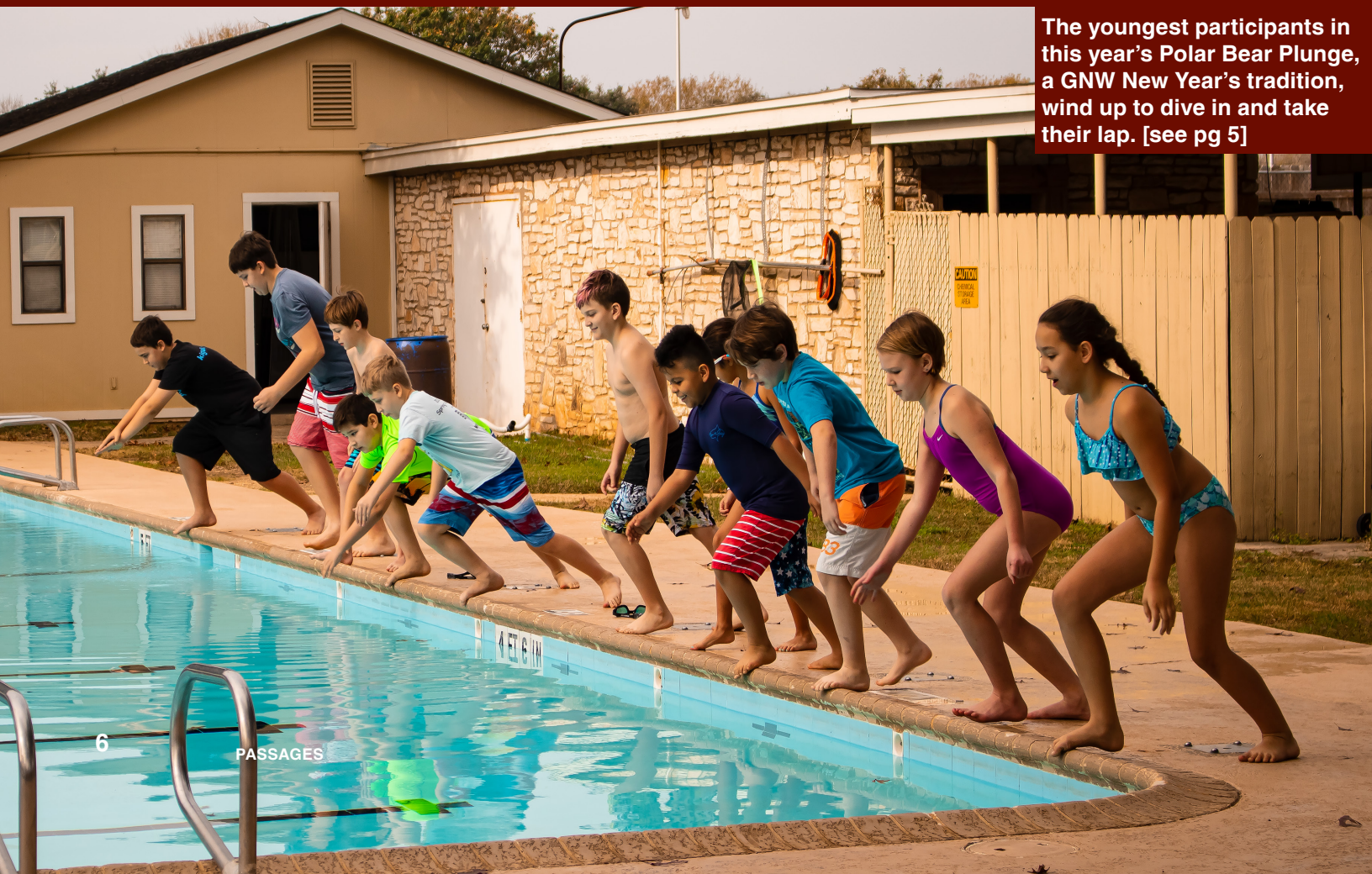
The youngest participants in this year’s Polar Bear Plunge, a GNW New Year’s tradition, wind up to dive in and take their lap. [see pg 5]