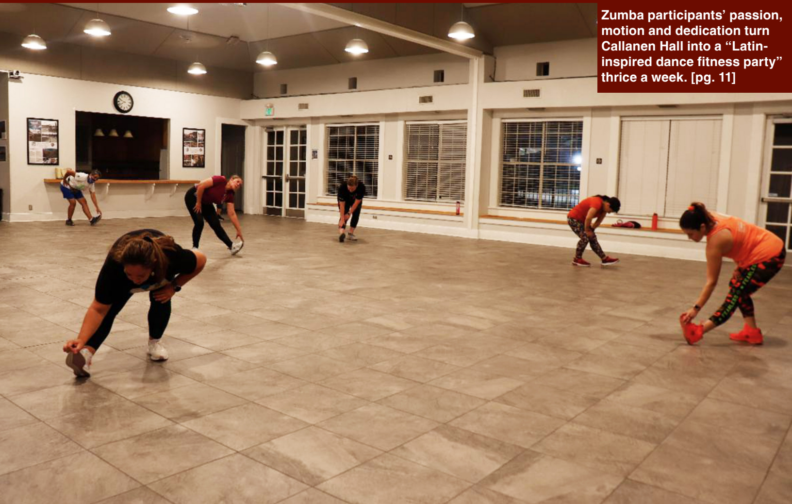
Zumba participants' passion, motion and dedication turn Callanen Hall into a "Latin-inspired dance fitness party" thrice a week. [pg. 11]