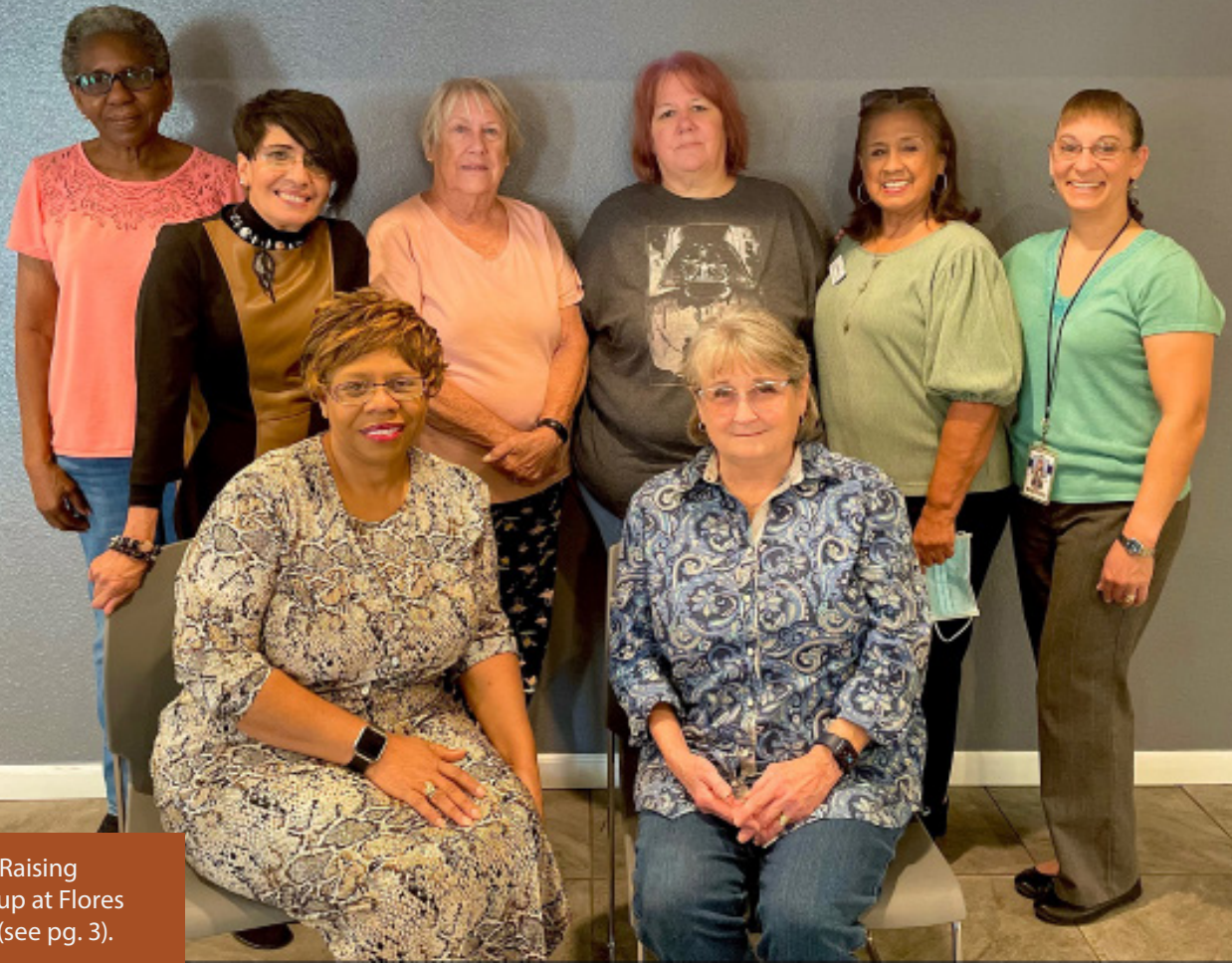
The Grandparents Raising Grandchildren group at Flores Hall in September (see pg. 3).