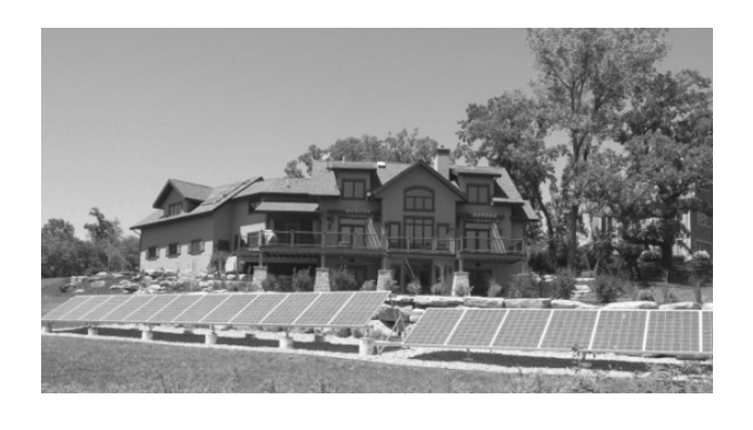
Front Yard Panels

Published by Great Northwest Main Office: 8809 Timberwilde St San Antonio, TX